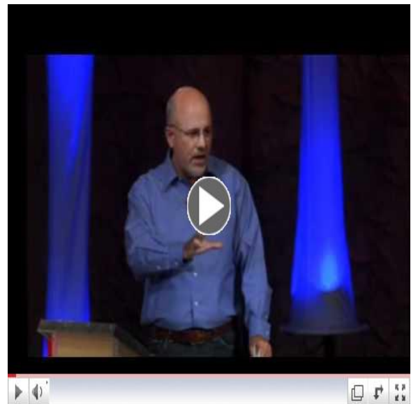
Financial Peace University - Military Edition

More than 12,000 military families have already experienced the benefits of Financial Peace Military Edition. Check it out!